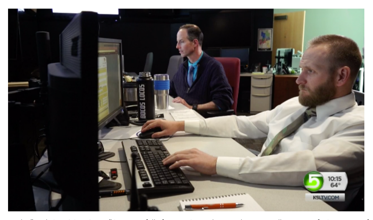
The "Real Time Crime Center" is a room full of TV monitors where analysts can pull up maps of crime, maps of probationers and parolees, and an extensive network of publicly and privately owned cameras.

They can also pull up the network of cameras to search through footage for an investigation or track a crime in real time as it's occurring. This allows them to direct officers on the street where to go and what to expect.